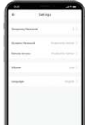
Modify Lock's Features