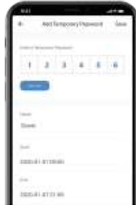
Share Temporary Password