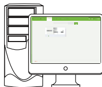
ZKTime Net 3.0