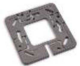
Option Wall Plate for Surface Mounting