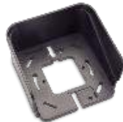
Option Visual Cover