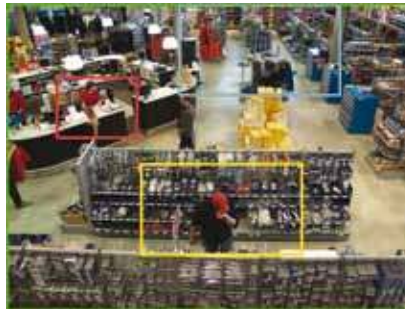
Full overview enabling cropped view areas