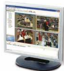
Multiple virtual camera views (up to eight views possible)