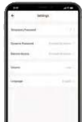
Modify Lock's Features