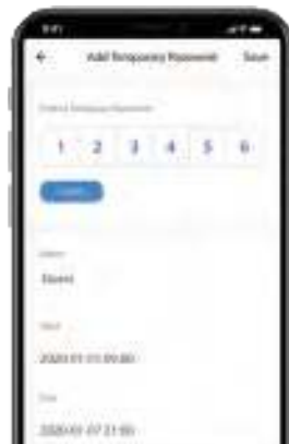
Share Temporary Password