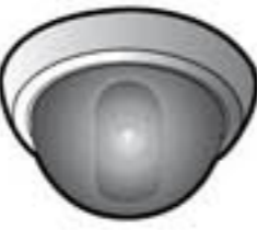
▶ Dome Cover