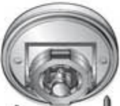
▶ Dome Base