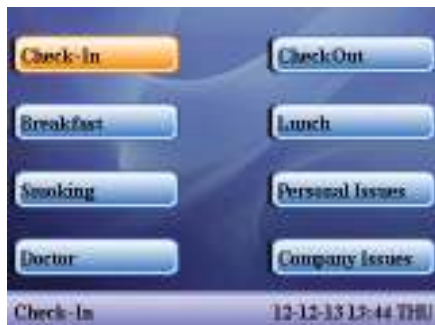
Function keys definition