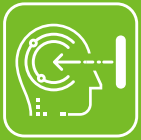
Proactive Facial Recognition