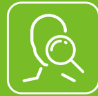
Touchless for Better Hygiene