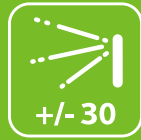
Wide Pose Angle Acceptance